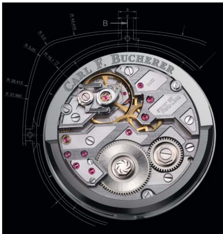
A revolutionary proprietary calibre with peripheral rotor – the CFB A1000 by Carl F. Bucherer.

was ruled out right from the start. Moreover, the team rapidly opted for an innovative self-winding movement endowed with unique construction features. The resulting CFB A1000 calibre expresses a philosophy heralding a whole new era thanks to creative developments such as the oscillating weight placed on the outer rim, along with innovative techniques such as