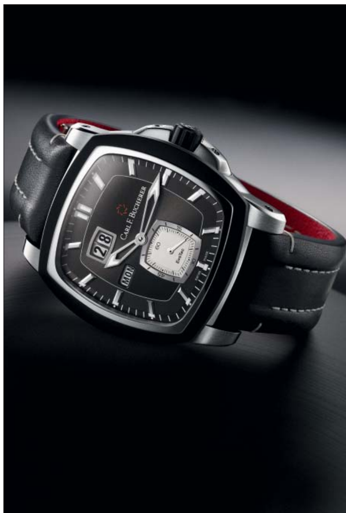
The new Patravi EvoTec DayDate by Carl F. Bucherer.