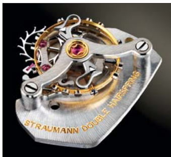
Straumann Double Hairspring escapement – two balance-springs to compensate for errors due to the force of gravity.

In 1826, towards the end of his apprenticeship and a period spent as a journeyman, Heinrich Moser contemplated where and how he might build a successful future for himself. In fact, his aim was to introduce the manufactory method of working based on the principle of the division of labour in his home town of Schaffhausen, and to establish a small watch factory for this purpose. However, the Town Council at the time declined his proposal and awarded the honorary office of town watchmaker to another individual. Moser emigrated to St. Petersburg, in Russia, where he founded the trading company, “H. Moser & Co.,” at the end of 1828. From this company name, Moser also developed the company signature in cursive script, which was almost always supplemented by a medallion. Until about 1918, with rare exceptions, the company name in Cyrillic and/or Latin script, as well as the medallion, remained the standard signature on all the watches marketed by Moser’s watch companies, whether sourced from its own production or from outside suppliers.