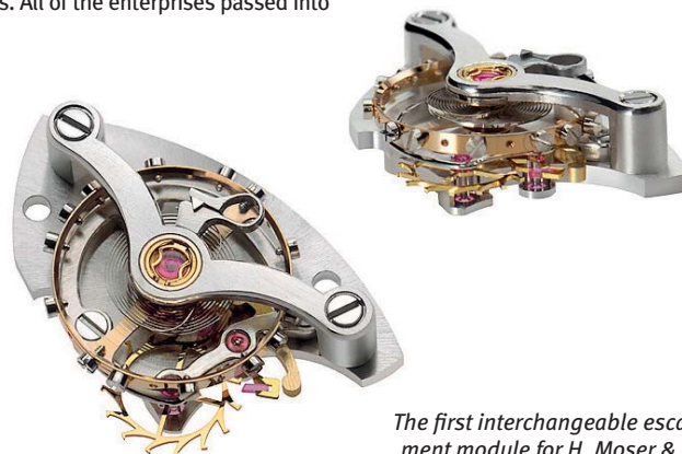
The first interchangeable escapement module for H. Moser & Cie wristwatches.

We have now come full circle, and, as the great-grandson expressed it so poignantly in an interview: “I find it very moving that we are now in a position to make Heinrich Moser’s return to Schaffhausen as a watchmaker possible 200 years after his birth.”